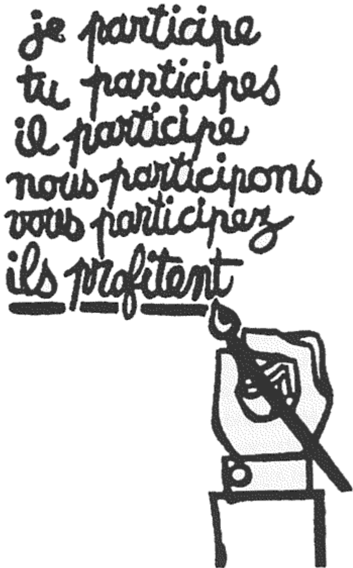
Figure 1. French student poster. In English, "I participate, you participate, he participates, we participate, you participate...they

Because the question has been a bone of political contention, most of the answers have been purposely buried in innocuous euphemisms like "self-help" or "citizen involvement." Still others have been embellished with misleading rhetoric like "absolute control" which is something no one - including the President of the United States - has or can have. Between understated euphemisms and exacerbated rhetoric, even scholars have found it difficult to follow the controversy. To the headline reading public, it is simply